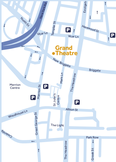
Map of Leeds Grand Theatre location and nearby parking

The Howard Assembly Room, Leeds Grand Theatre, 46 New Briggate, Leeds LS1 6NZ